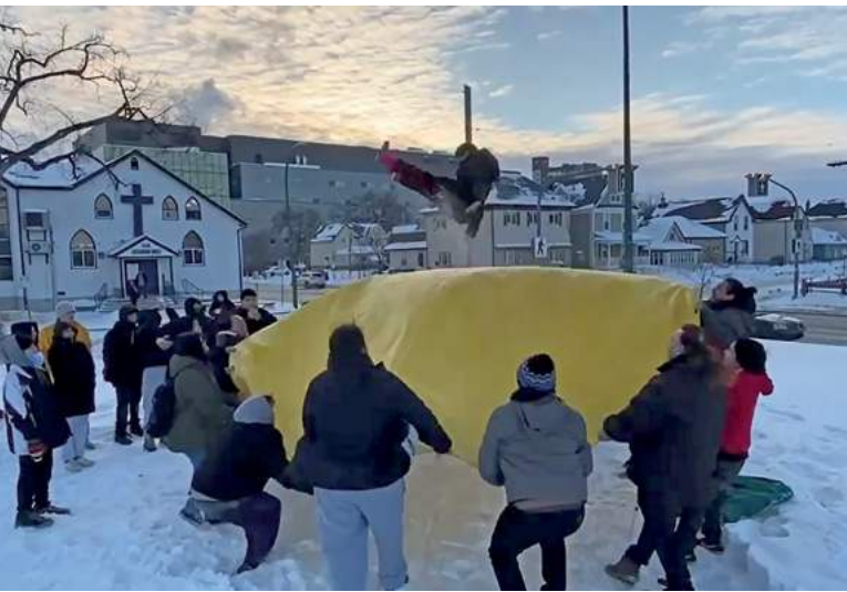
Dozens of children and youth took part in the annual Winter Games competing in several indoor and outdoor activities including the super-fun blanket toss!

Since 1976, Rossbrook House has taken pride in being a safe place for children and youth, ages 6 to 24. Please help us ensure we continue to be a safe place through donating towards the required updates to an aging building.