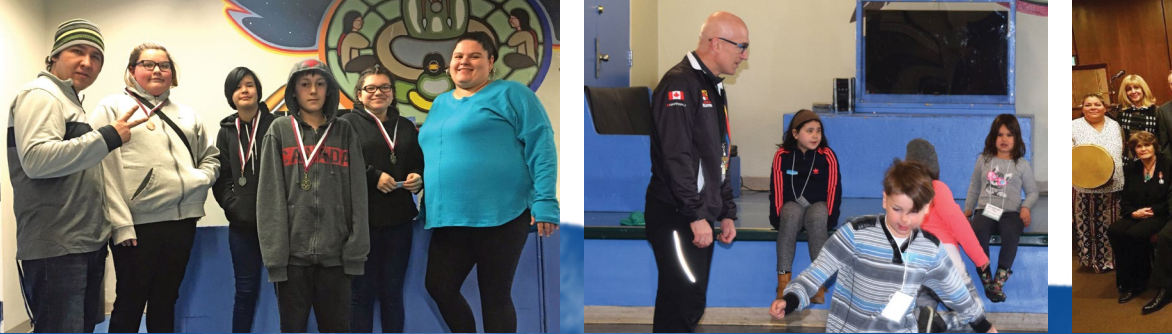
The Annual Winter Games run for a week every January with outdoor & indoor activities and end with medals & prizes!